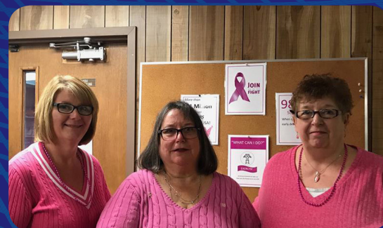
Blue Chip FCU Burnham Branch employees wear their pink for Breast Cancer Awareness Days!

Blue Chip employees and members enjoyed catching up at September's Amtrak/PennDOT Health and Safety Fair.